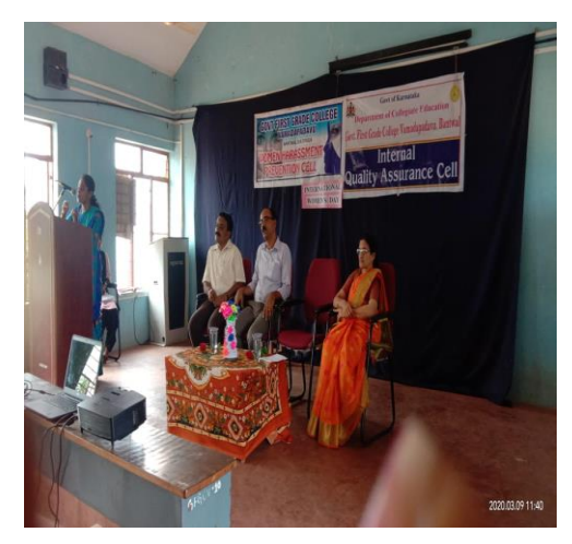
Vamadapadavu First grade college

4. The status of Mangalore Zone regarding kidney registration etc.